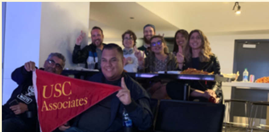
Young Leaders and their guests display their Trojan Spirit at the Staples Center