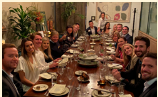
Young Leaders enjoy a multicourse dinner in a private dining room at Cassia