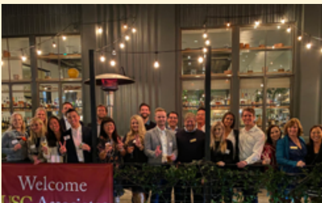
Young Leaders network during reception at Cassia restaurant in Santa Monica