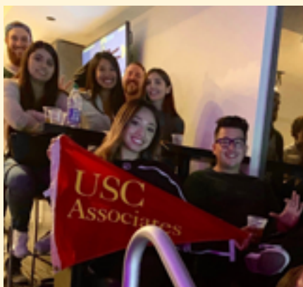
Young Leaders enjoyed viewing the game while networking with fellow professionals