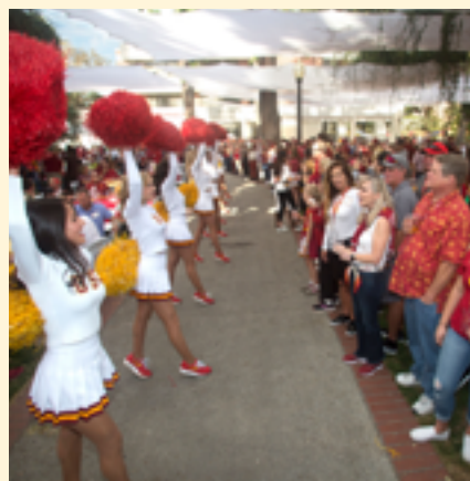
The USC Song Girls perform at picnic