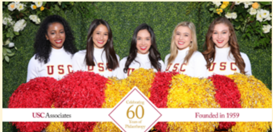
The USC Song Girls